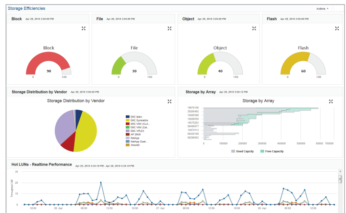
Figure 1. APTARE IT Analytics' storage console helps organizations reduce complexity, proactively manage storage and optimize performance.