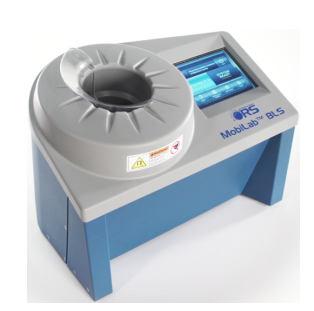
High-Throughput Bottle Liquid Scanner