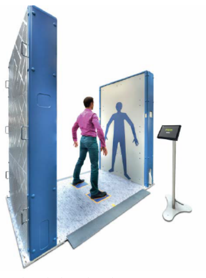
Enhanced Advanced Imaging Technology