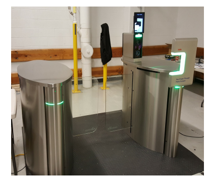
Biometric Authentication Technology