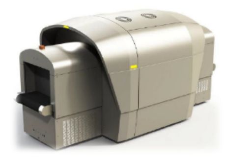
IDSS CT Scanner