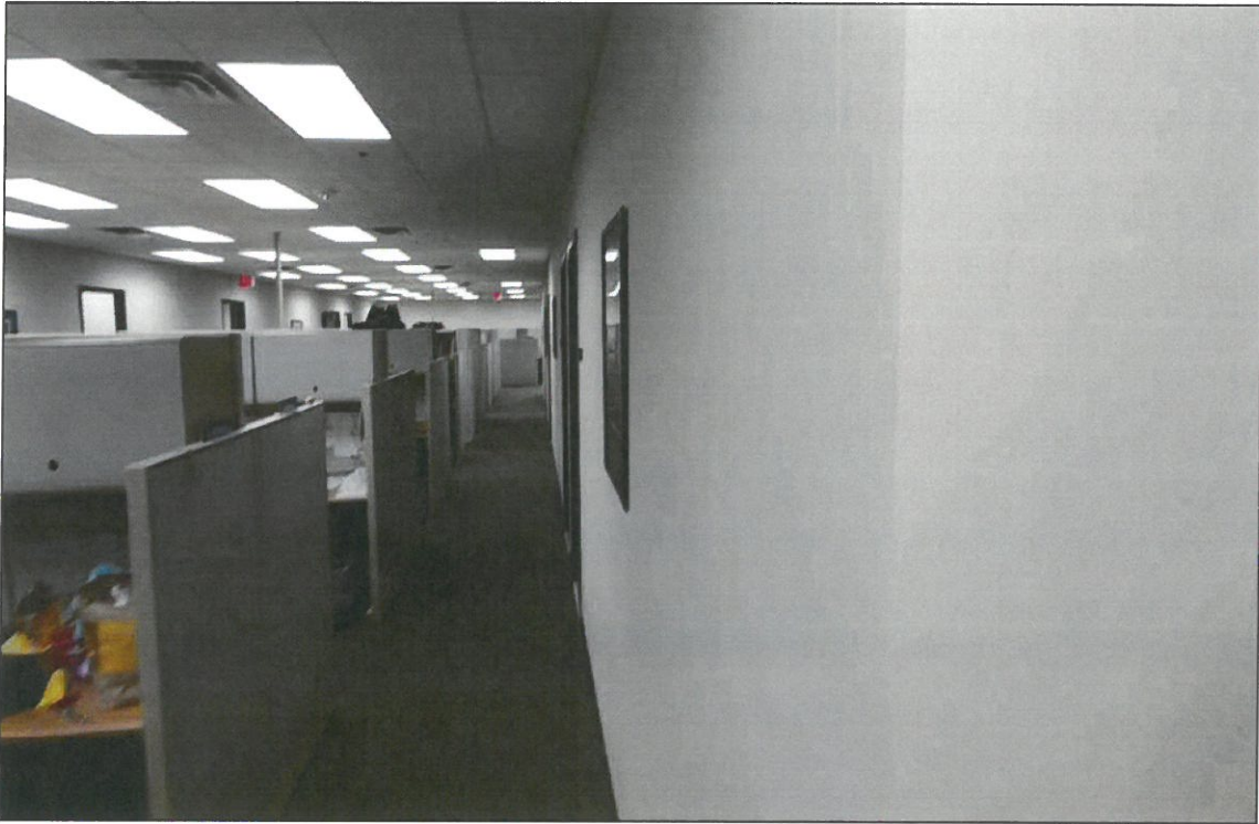
Photo 5 – SSA OHO Area - Eastgate Metroplex 14002 E. 21 st Street Tulsa, OK 74134