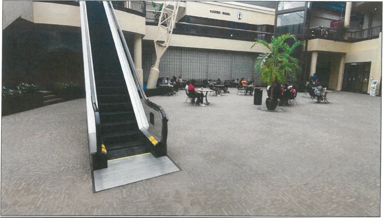
Photo 1 – Common Waiting Area - Eastgate Metroplex 14002 E. 21 st Street Tulsa, OK 74134