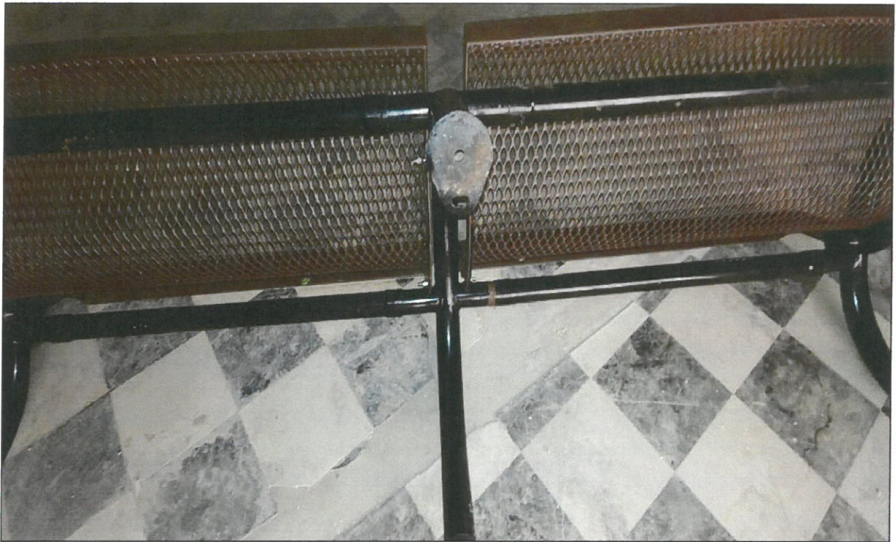
Photo 4 – Office Furniture Metal Tubing Openings Eastgate Metroplex 14002 E. 21 st Street Tulsa, OK 74134