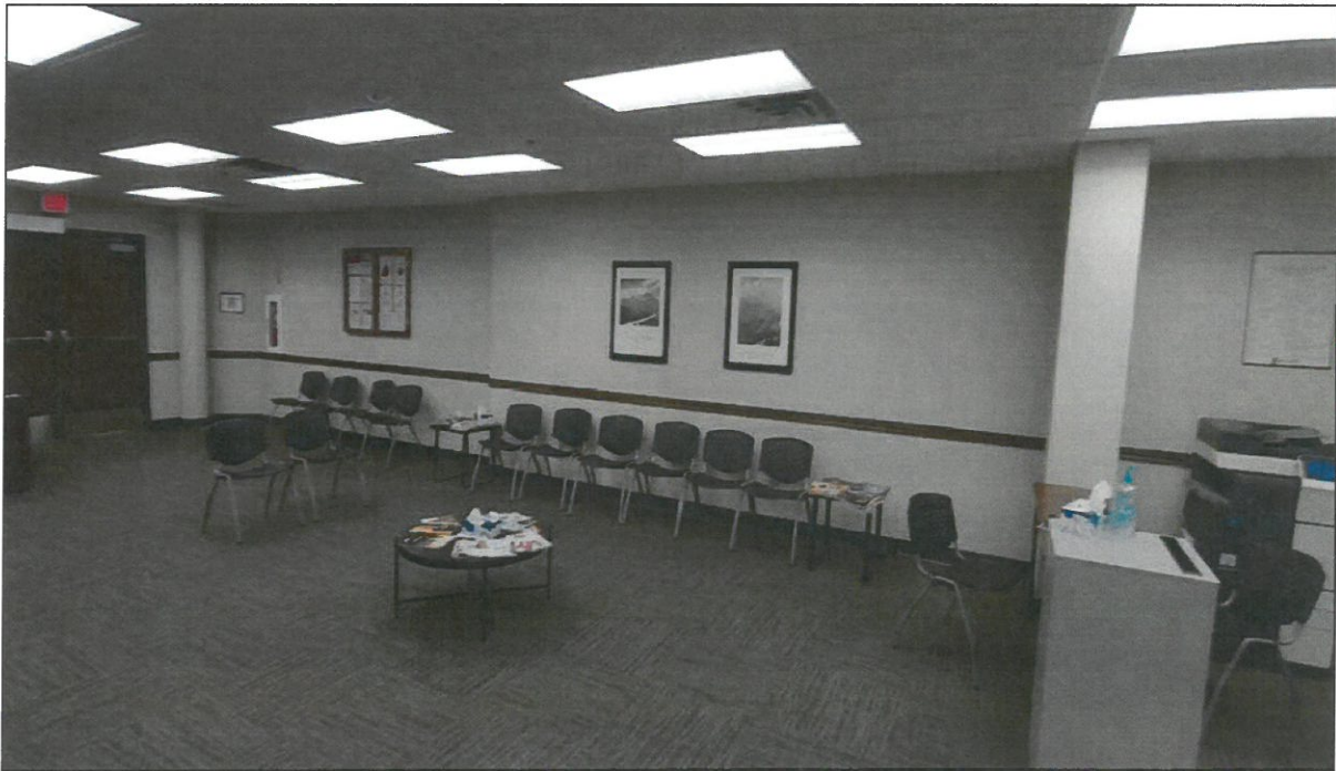
Photo 8 – Waiting Room Seating/Furniture SSA OHO Eastgate Metroplex 14002 E. 21 st Street Tulsa, OK 74134