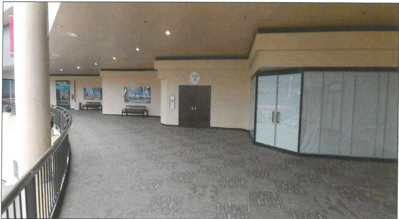
Photo 2 – Common Hallway Area - Eastgate Metroplex 14002 E. 21 st Street Tulsa, OK 74134