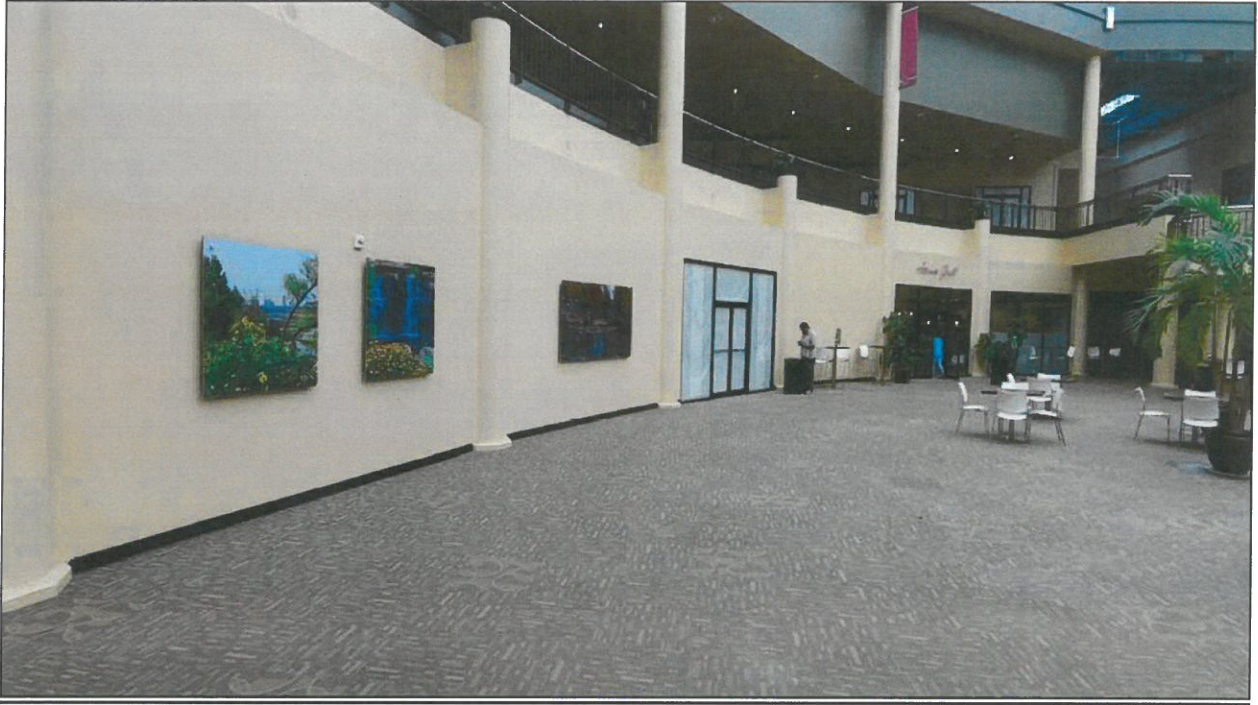
Photo 3 – Common Area Furniture - Eastgate Metroplex 14002 E. 21 st Street Tulsa, OK 74134