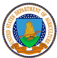
U.S. Department of Agriculture Agricultural Marketing Service